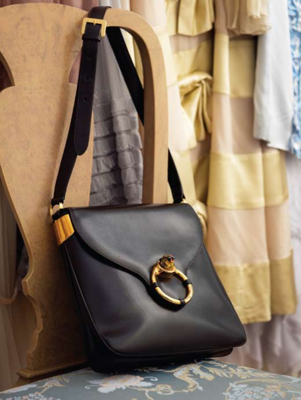
DESIGNER BAGS Above 1960's satchel bag with tiger's head clasp by Gucci, £350-£500, at Kerry Taylor Auctions