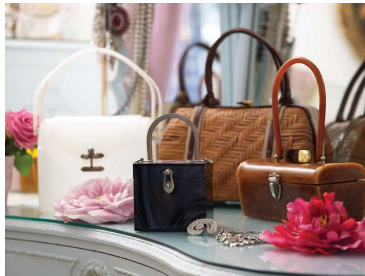
NOVELTY BAGS Above, from left Mother of pearl Lucite bag, c1960s, £250; dark grey 1960s mini Lucite bag, £100, both from Linda Bee; 1950's wicker bag, £90, from Vintage Modes, all at Grays. 1940s Lucite novelty bag, £145, from Samaya Ling Vintage Collections